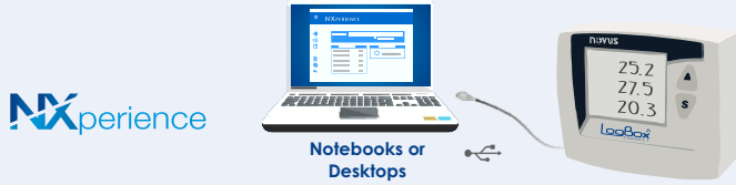
Notebooks or Desktops

NXperience can download data from several LogBoxes in customer facilities.